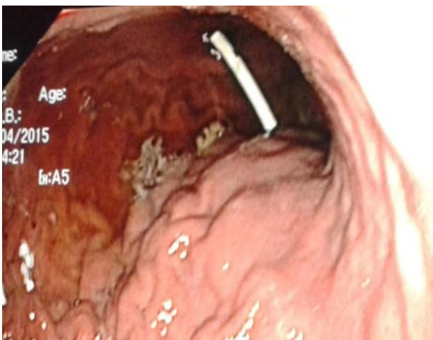
Fig. 3 – Upper endoscopy after placement of the prosthesis.

The intervention was finished uneventfully, without complications. The control abdominal ultrasound showed the reduction of the PPC size, the day after the procedure (Figure 4).