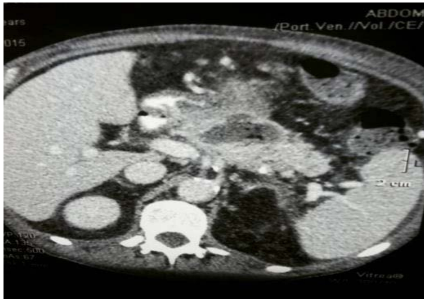
Fig. 6 – Computed tomography (CT) scan, one month after the procedure and prosthesis removal.

complete resolution of the PPC (Figure 6). The patient had no further complaints on follow-up conducted 3 months after the procedure.