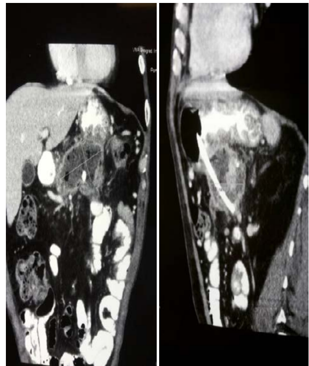
Fig. 5 – Computed tomography (CT) scan, one week after the procedure.

On the same day after the procedure, the patients started to take liquids and, on the next day, normal food and oral nutritional supplements for the improvements of nutritional status. On CT scan performed 7 days after the procedure, a size of the PPC was decreased for 7–8 cm in diameter (Figure 5).