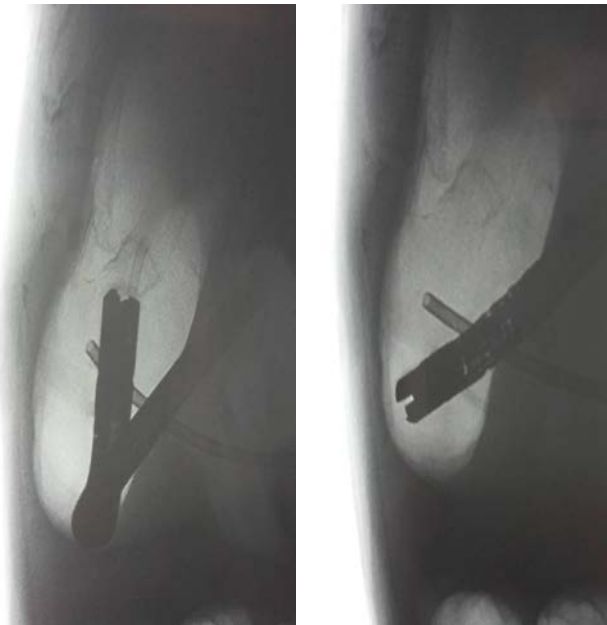
Fig. 2 – Placement of biliary stent under fluoroscopy.

Due to clinical condition of the patient (persisting vomiting, delayed gastric emptying and inability for normal food intake), it was decided that minimally invasive PPC drainage should be performed after initial resuscitation. Under fluoroscopy, using lateral duodenoscope (Pentax ED® 3490TK working channel 4.2), a incision on the posterior wall of the stomach was made, afterwards dilatation of the incision whole with biliary balloon diameter and length of 6 mm and 4 cm, respectively. After dilatation, the plastic biliary prosthesis of 12 French and 8 cm of length was placed throughout posterior stomach wall into the PPC (Figures 2 and 3).