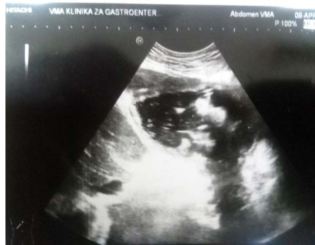
Fig. 4 – Abdominal ultrasound, the day after the procedure.

The intervention was finished uneventfully, without complications. The control abdominal ultrasound showed the reduction of the PPC size, the day after the procedure (Figure 4).